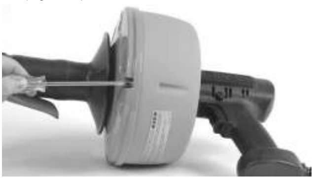
Figure 9 – Loosen Four (4) Screws From Back Half of Canister About Three (3) Full Turns