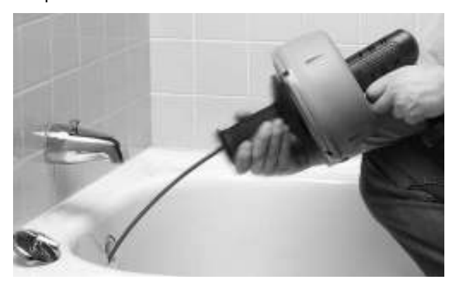
Figure 5 - Pull Hand Grip Rearward To Engage Clutch

Place FORWARD/REVERSE button in FORWARD position.