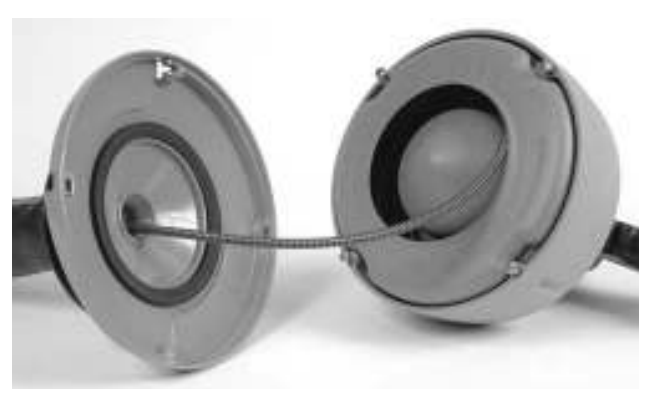
Figure 10B – Pass Exposed Cable Through Front Half and Reassemble to Back Half of Canister