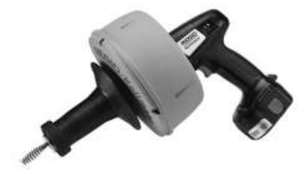
Figure 3 - K-39B Drain Cleaner

The Model K-39B ( Figure 3 ) battery powered version eliminates the need for a power outlet or extension cord at the point of application. It is offered with the slide-action chuck and the autofeed assembly.