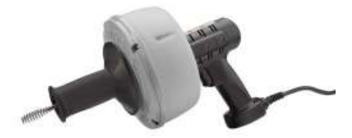
Figure 1 – K-39 Drain Cleaner With C-1 Cable