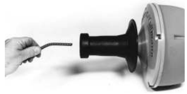
Figure 11 - Loading Loose Cable Into Canister

NOTE! For easier cable installation, bend small end of cable one inch from end 15 to 30 degrees. (Refer to Figure 12)