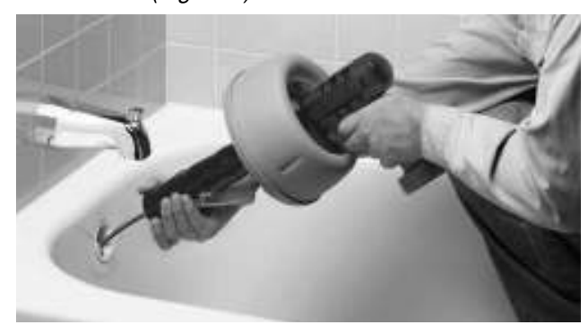
Figure 8 – Keep Distance Between Drain Opening and Nose of Drain Gun to 6" or Less

1. Insert cable into drain opening by hand as far as possible before turning machine on. Leave approximately 6" of cable between drain opening and nose of machine (Figure 8).