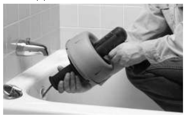
Figure 6 - Push Cable Down Drain Line