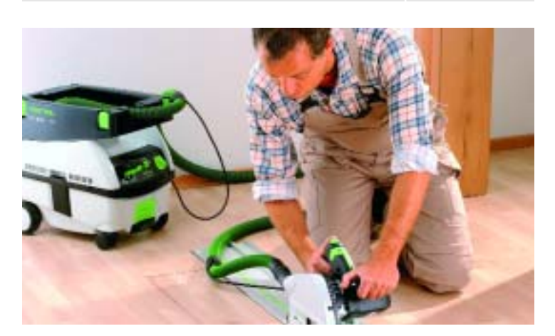
Using the TS 55 to saw timber floors: