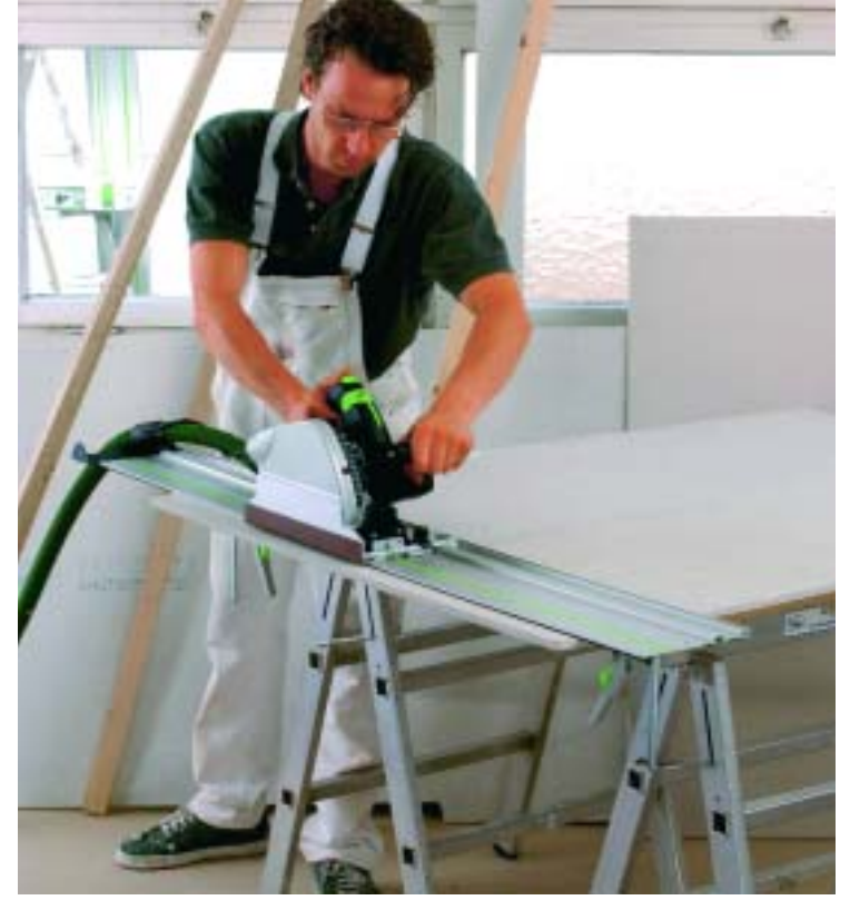
Using the TS 55 to saw MDF: clean, quick and tested for use on Australian building sites.